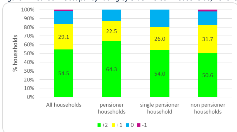
Figure 2: Bedroom Occupancy rating of Older Person Households, Ashover Parish, 2011

The data suggests that older person households are more likely to under occupy their dwellings. The Census allows us to investigate this using the commonly used ‘bedroom standard’. Some 64% of pensioner households have an occupancy rating of +2 or more (meaning there are at least two more bedrooms that are technically required by the household; this compares with 51% for non-pensioner households). Further analysis indicates that under occupancy is far more common in households with two or more pensioners than single pensioner households.